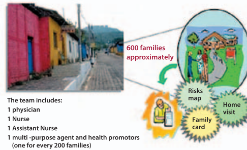
Figure 01: Family teams. Rural (counties and villages).

The Ministry of Health has participated in this telehealth project since October 2010. The first thing done