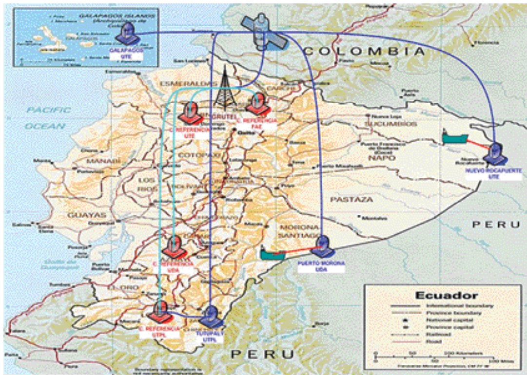
Figure 02 - Geo-referenced scheme of the national program.