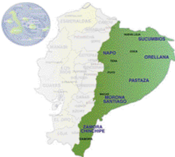
Figure 04 - Mapa de la Región Amazónica.