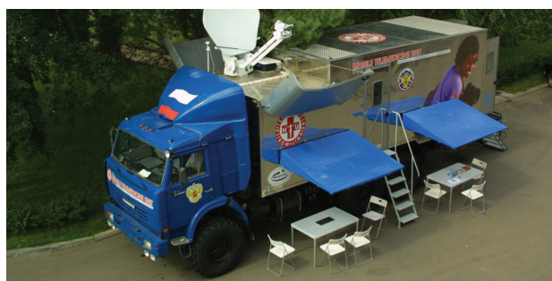
Fig. 2: General view of Mobile Telemedicine Unit in working position

The Mobile Telemedicine sea-vessel hospital (Fig. 3) allows the simultaneous hospitalization up to 400 patients with rendering of all necessary medical services. The vessel is equipped with laboratories, operational units, systems of independent air-conditioning and air clearing, quarantine unit. The vessel cargo deck is intended for transportation of mobile telemedicine trucks, including air cushion telemedicine ships, helicopters or seaplanes for servicing of distant continental areas. All conditions for comfortable residing of the medical personnel and a vessel crew are provided at the vessel.